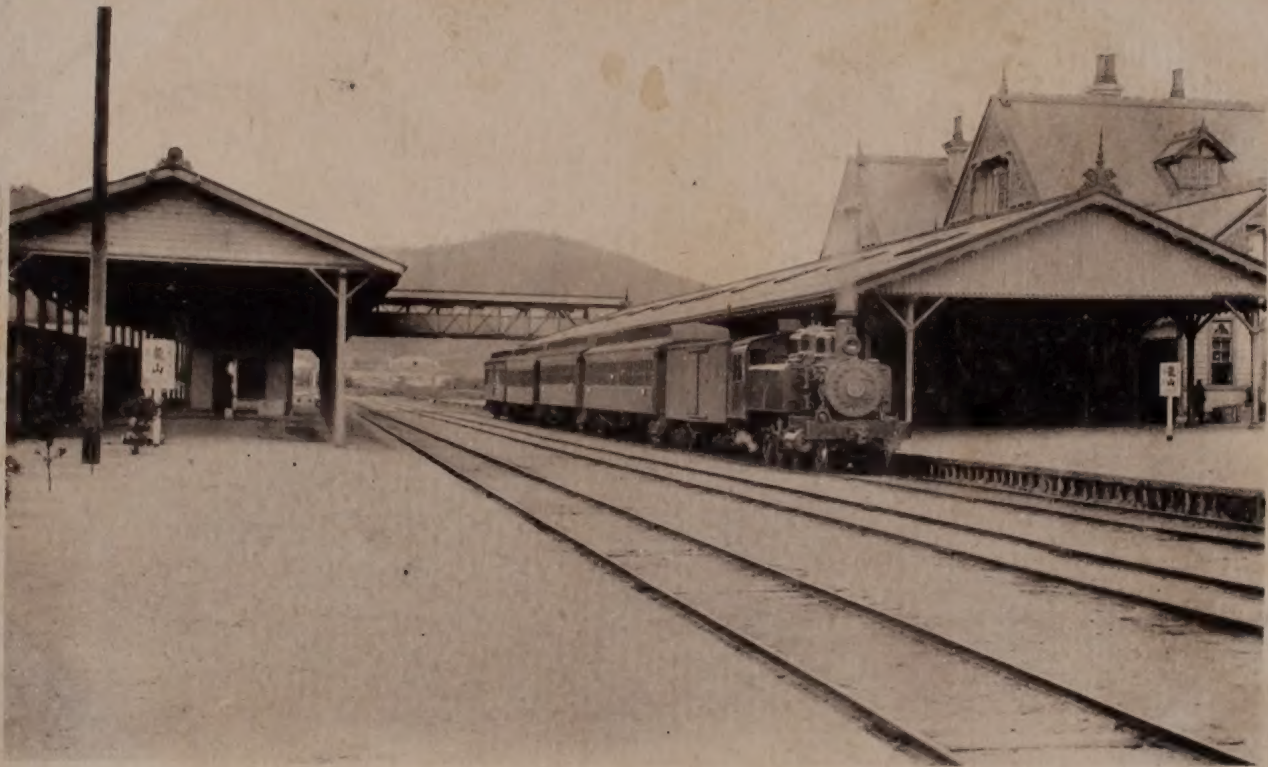
THE RYUZAN STATION.